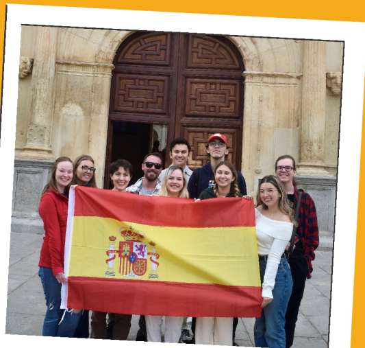
Alcalá de Henares Study Abroad – 2024 Participants

University of Victoria School of Languages, Linguistics and Cultures